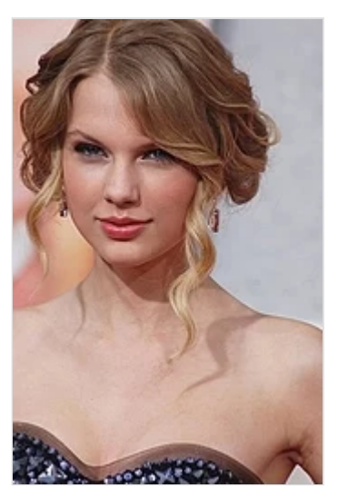
Swift at the 2009 premiere of <u>Hannah Montana: The Movie</u>. She had a cameo appearance in the film and wrote two songs for <u>its</u> soundtrack. [70][71]

Swift's second studio album, Fearless, was released on November 11, 2008, in North America, [72] and in March 2009 in other markets. [73] Critics lauded Swift's honest and vulnerable songwriting in contrast to other teenage singers. [74] Five singles were released in 2008–2009: "Love Story", "White Horse", "You Belong with Me", "Fifteen", and "Fearless". The first single peaked at number four on the Billboard Hot 100 and number one in Australia. \frac{[56][75]}{} It was the first country song to top Billboard 's Pop Songs chart. [76] "You Belong with Me" was the album's highest-charting single on the Billboard Hot 100, peaking at number two, \frac{[77]}{} and was the first country song to top Billboard 's all-genre Radio Songs chart. [78] All five singles were Hot Country Songs top-10 entries, with "Love Story" and "You Belong with Me" topping the chart. [79] Fearless became her first number-one album on the Billboard 200 and 2009's top-selling album in the US. [80] The Fearless Tour, Swift's first headlining concert tour, grossed over $63 million. [81] Journey to Fearless , a documentary miniseries, aired on television and was later released on DVD and Blu-ray. [82] Swift also performed as a supporting act for Keith Urban's Escape Together World Tour in 2009. [83]