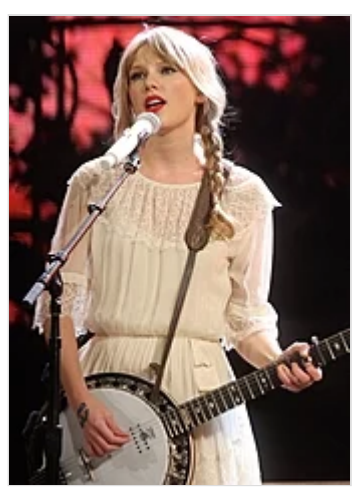
Swift performing at the Speak Now World Tour in 2012

In August 2010, Swift released "Mine", the lead single from her third studio album, Speak Now . It entered the Hot 100 at number three. Swift wrote the album alone and co-produced every track. It was released on October 25, 2010, opening atop the Billboard 200 with over one million copies sold. It became the fastest-selling digital album by a female artist, with 278,000 downloads in a week. Critics appreciated Swift's grown-up perspectives; Rob Sheffield of Rolling Stone wrote, in a mere four years, the 20-year-old Nashville firecracker has put her name on three dozen or so of the smartest songs released by anyone in pop, rock or country. Back to December, "Mean, "The Story of Us, "Sparks Fly," and "Ours" became subsequent singles, with the latter two reaching number one on the Hot Country Songs and the first two peaking in the top ten in Canada. She dated actor Jake Gyllenhaal in 2010.