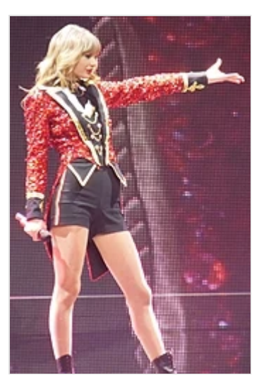
Swift on the Red Tour (2013)

Trouble" reached the top five on charts in Australia, Canada, Denmark, Ireland, New Zealand, the UK and the US. [127] "Begin Again", "22", and "Red" reached the top 20 in the US. [56] On Red , released on October 22, 2012, [128] Swift worked with Chapman and Rose, as well as the new producers Max Martin and Shellback. [129] It incorporated many pop and rock styles such as heartland rock, dubstep and dance-pop. [130] Randall Roberts of Los Angeles Times said Swift "strives for something much more grand and accomplished" with Red .[131] It opened at number one on the Billboard 200 with 1.21 million sales, making Swift the first female to have two million-selling first-weeks. [132][133] Red was Swift's first number-one album in the UK. [134] It earned several accolades, including four nominations at the 56th Annual Grammy Awards (2014).[135] Swift received American Music Awards for Best Female Country Artist in 2012, Artist of the Year in 2013, [136][137] and the Nashville Songwriters Association's Songwriter/Artist Award for the fifth and sixth consecutive vears. [138] The Red Tour ran from March 2013 to June 2014 and grossed