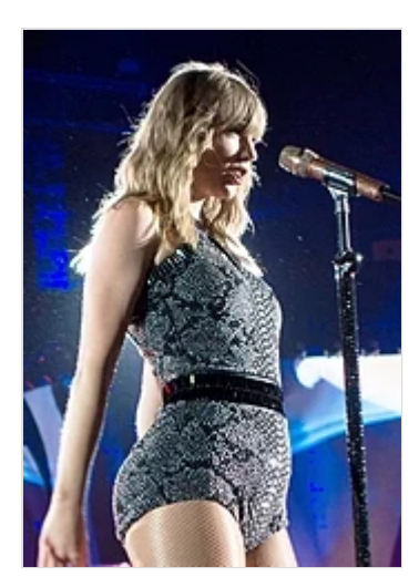
Swift on her Reputation Stadium Tour (2018), the highest-grossing North American tour ever

during the streaming service's free three-month trial period and stated that she would pull 1989 from the catalog. [160] The following day, Apple Inc. announced that it would pay artists during the free trial period, [161] and Swift agreed to let 1989 on the streaming service. [162] She then returned her entire catalog plus 1989 to Spotify, Amazon Music and Google Play and other digital streaming platforms in June 2017. [163] Swift was named Billboard 's Woman of the Year in 2014, becoming the first artist to win the award twice. [164] At the 2014 American Music Awards, Swift received the inaugural Dick Clark Award for Excellence. [165] On her 25th birthday in 2014, the Grammy Museum at L.A. Live opened an exhibit in her honor in Los Angeles that ran until October 4, 2015, and broke museum attendance records. [166][167] In 2015, Swift won the Brit Award for International Female Solo Artist. [168] The video for "Bad Blood" won Video of the Year and Best Collaboration at the 2015 MTV Video Music Awards. [169] At the 58th Grammy Awards (2016), 1989 won Album of the Year and Best Pop Vocal Album, making Swift the first woman and fifth act overall to win Album of the Year twice. [170]