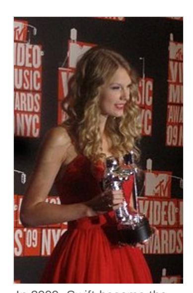
In 2009, Swift became the first country singer in history to win an MTV Video Music Award.