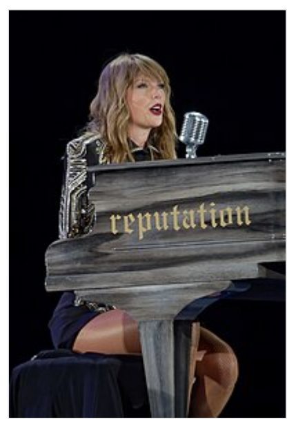
Swift performing on the Reputation Stadium Tour in Seattle in May 2018

Critics have highlighted Swift's versatility as an entertainer, praising her ability to switch onstage <u>personas</u> and performance styles depending on the varying themes and aesthetics of her